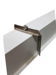
Fixing bracket open