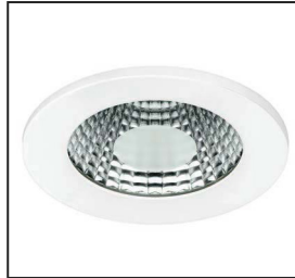
ECL/BEZ/IP54/CE IP54 Centre Etched. Requires bezel