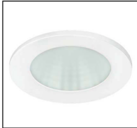
ECL/BEZ/IP54/FF IP54 Frosted Glass. Requires bezel