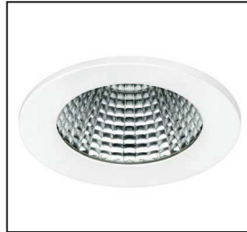
ECL/BEZ/IP54/CG IP54 Clear Glass. Requires bezel