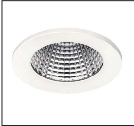
ELC/BEZ/WH White RAL 9010 bezel