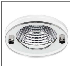
ECL/BEZ/HDG Halo Drop Glass on white bezel