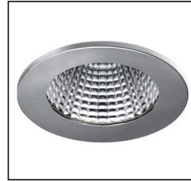
ELC/BEZ/BA Brushed Aluminium bezel