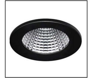
ELC/BEZ/BL Black RAL 9005 bezel