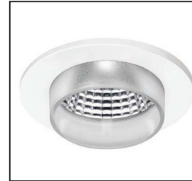
ECL/BEZ/VH Frosted vertical ring. Requires bezel