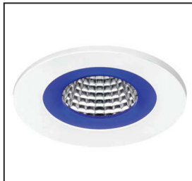
ECL/BEZ/HL/BL Blue hi-light ring. Requires bezel