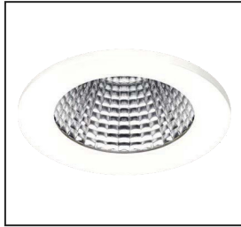
ELC/BEZ/BW Brilliant white RAL 9016 bezel