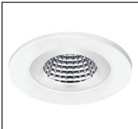
ECL/BEZ/HL/F Frosted hi-light ring. Requires bezel