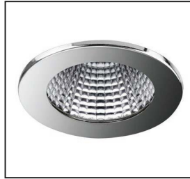
ELC/BEZ/CH Chrome bezel