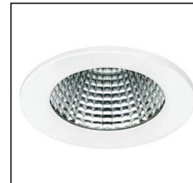
ECL/BEZ/IP65/CG IP65 Clear Glass. Requires bezel