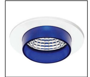
ECL/BEZ/VH/BL Blue vertical ring. Requires bezel