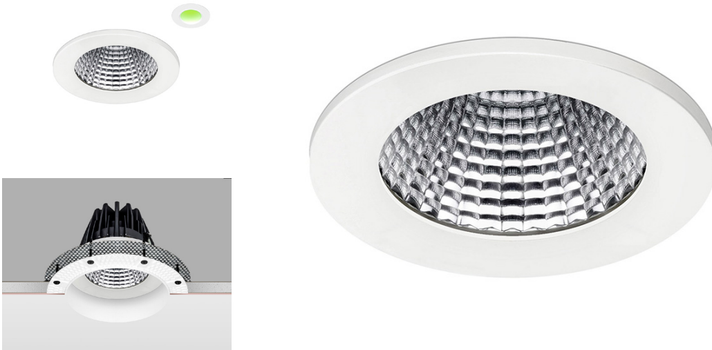
Plaster in option