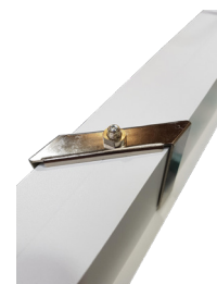
Fixing bracket closed